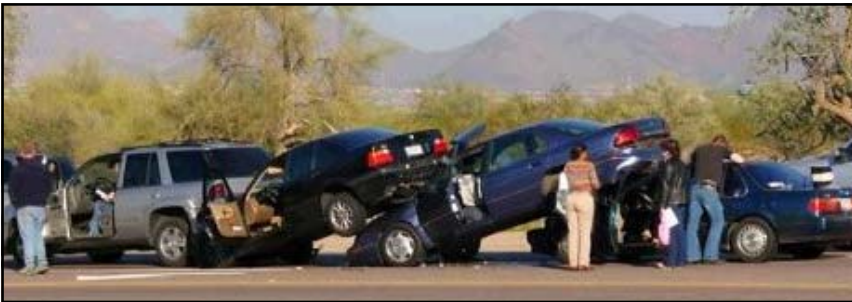
Car parking is one of the many and varied skills undertaken by G/B ACRM

Overall, the four events were all conducted well with members to be thanked for their commitment, without you and your families’ support we would simply collapse.